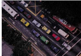
JVC Super LoLux™