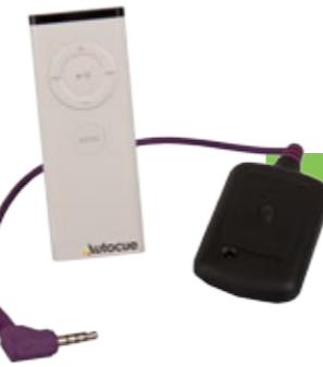
IR WIRELESS SCROLL CONTROL