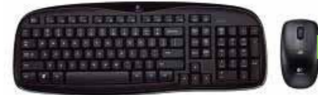
KEYBOARD & MOUSE