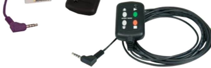
IPAD WIRED SCROLL CONTROL