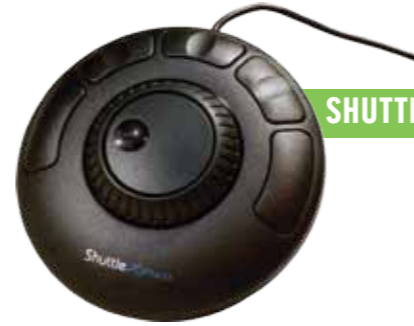
SHUTTLE EXPRESS SCROLL CONTROL