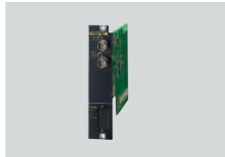
AJ-YA94G Serial Digital Interface Board