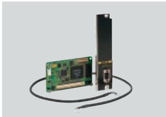
AJ-YAD255G IEEE 1394 Interface Board