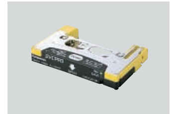
AJ-CS455P Mini-DV Cassette Adapter