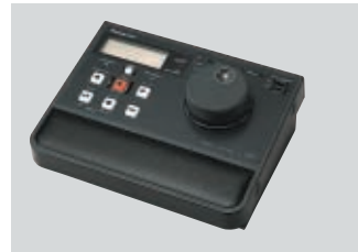
AJ-A95E Remote Control Unit (RS-422A)