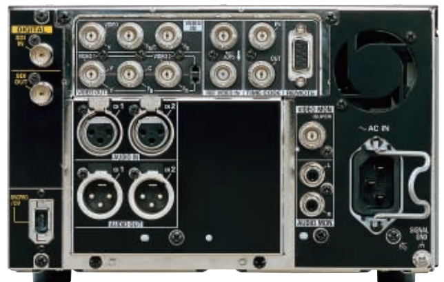
(equipped with optional AJ-YAD255G and AJ-YA94G interface boards)

*UMID stands for Unique Material Identifiers, which are defined for AV material use in the SMPTE 330M international standard.