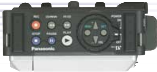
Top panel controls