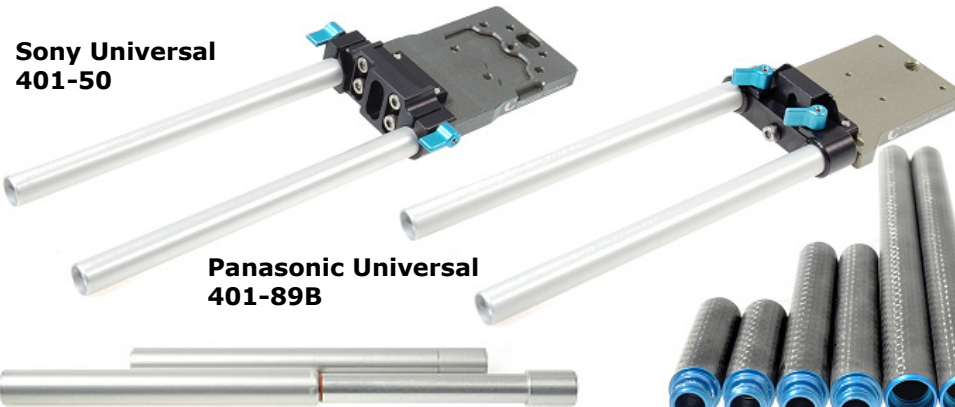
Sony Universal 401-50