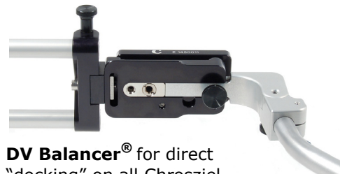
DV Balancer® for direct "docking" on all Chrosziel Light-weight supports of the 401- 4xx series or Camera Adaptor 3100.

The DV Balancer® comfortably places camcorders with built-in viewfinders in front of the eye leaving the hands free for camera control.