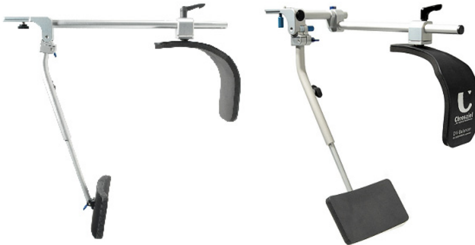
DV Balancer® ENG for angled ENG viewfinders and DSLR -cameras with video function.