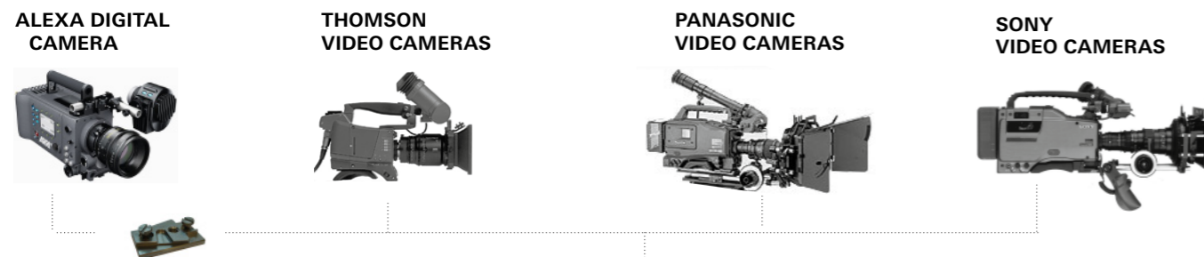
Wedge Adapter, WA-1 (needed for use with ALEXA) K2.72002.0