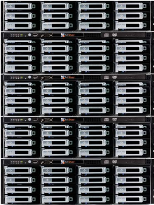
XSTREAM 3U Workflow Director and four Expansion Chassis