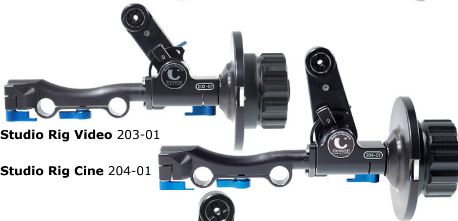
Studio Rig Video 203-01