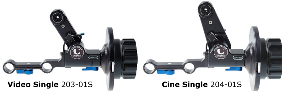
Video Single 203-01S