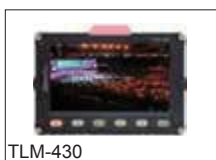
TLM-430 4.3" Look-Back Monitor