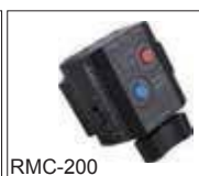
RMC-200 Look-back/recorder remote controller