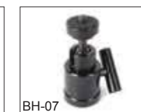
BH-07 Ball head