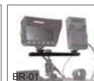
BR-01 Mounting bracket for DN-60A and TLM-430