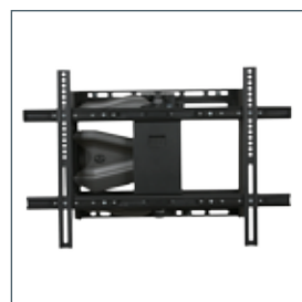
Space saving design - folds flat to wall