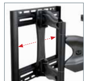
Lateral adjustment of arm position for a perfectly positioned display