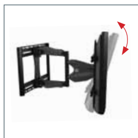
Features +15° tilt for optimum screen positioning