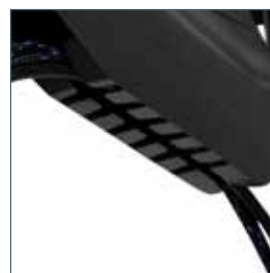
Integrated cable management for a smart installation