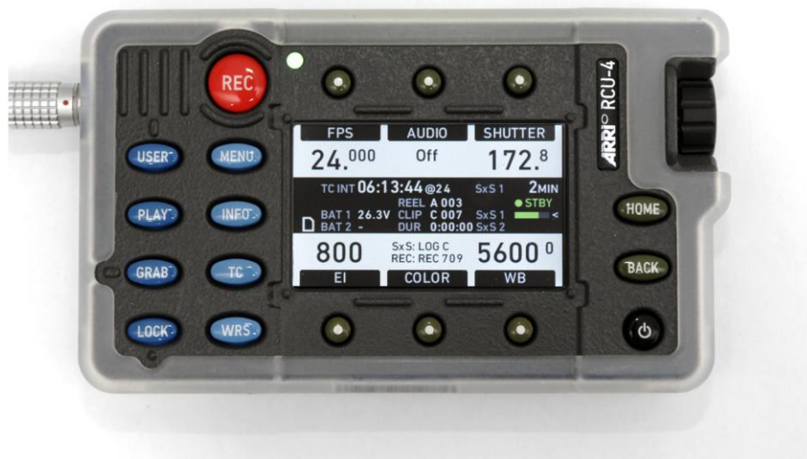
Figure 1: RCU-4