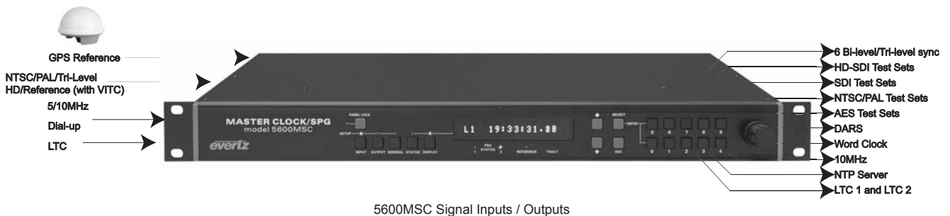
5600MSC Signal Inputs / Outputs