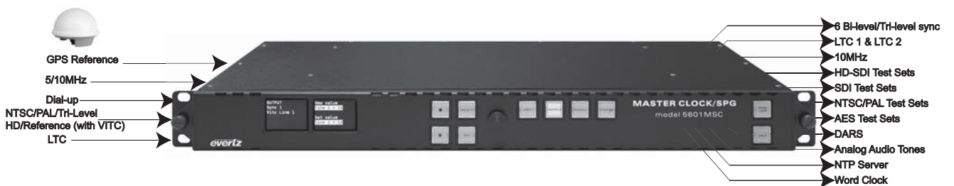
5601MSC Signal Inputs / Outputs