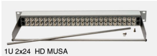
1U 2x24 HD MUSA